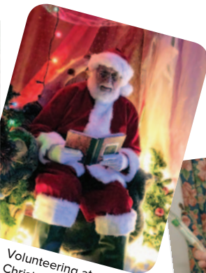
Volunteering at Christmas time